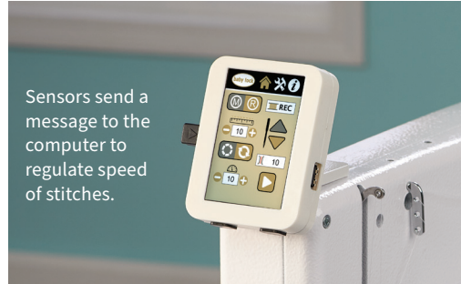
Sensors send a message to the computer to regulate speed of stitches.